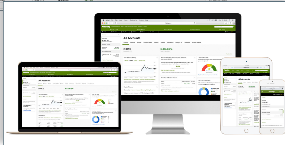
For illustrative purposes only.